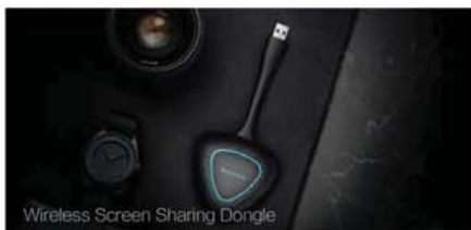
Wireless Screen Sharing Dongle