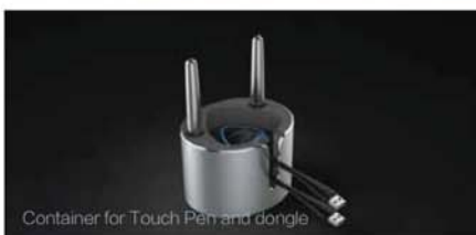
Container for Touch Pen and dongle