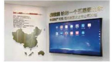
Country Garden Group