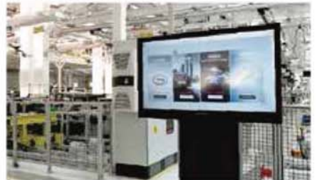
Guangzhou Automobile Group