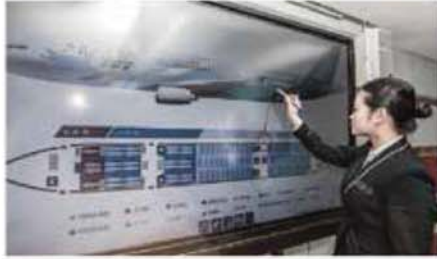
China Southern Airlines