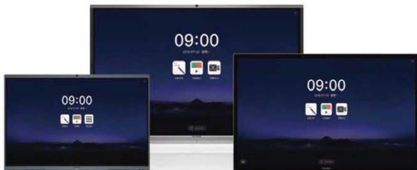
From left to right: MAXHUB X3 Standard, MAXHUB X3 Premium, MAXHUB X3 Ultimate