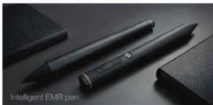
Intelligent EMR pen